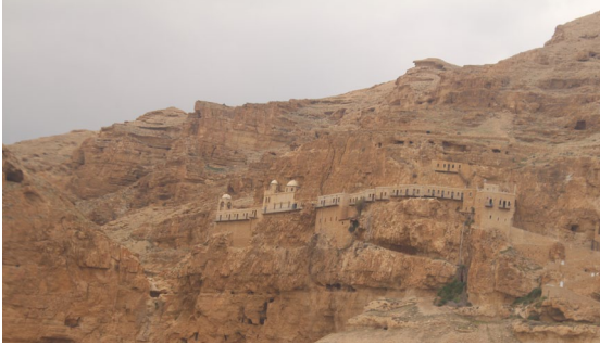
Photos taken during our 2017 Holy Land Pilgrimage