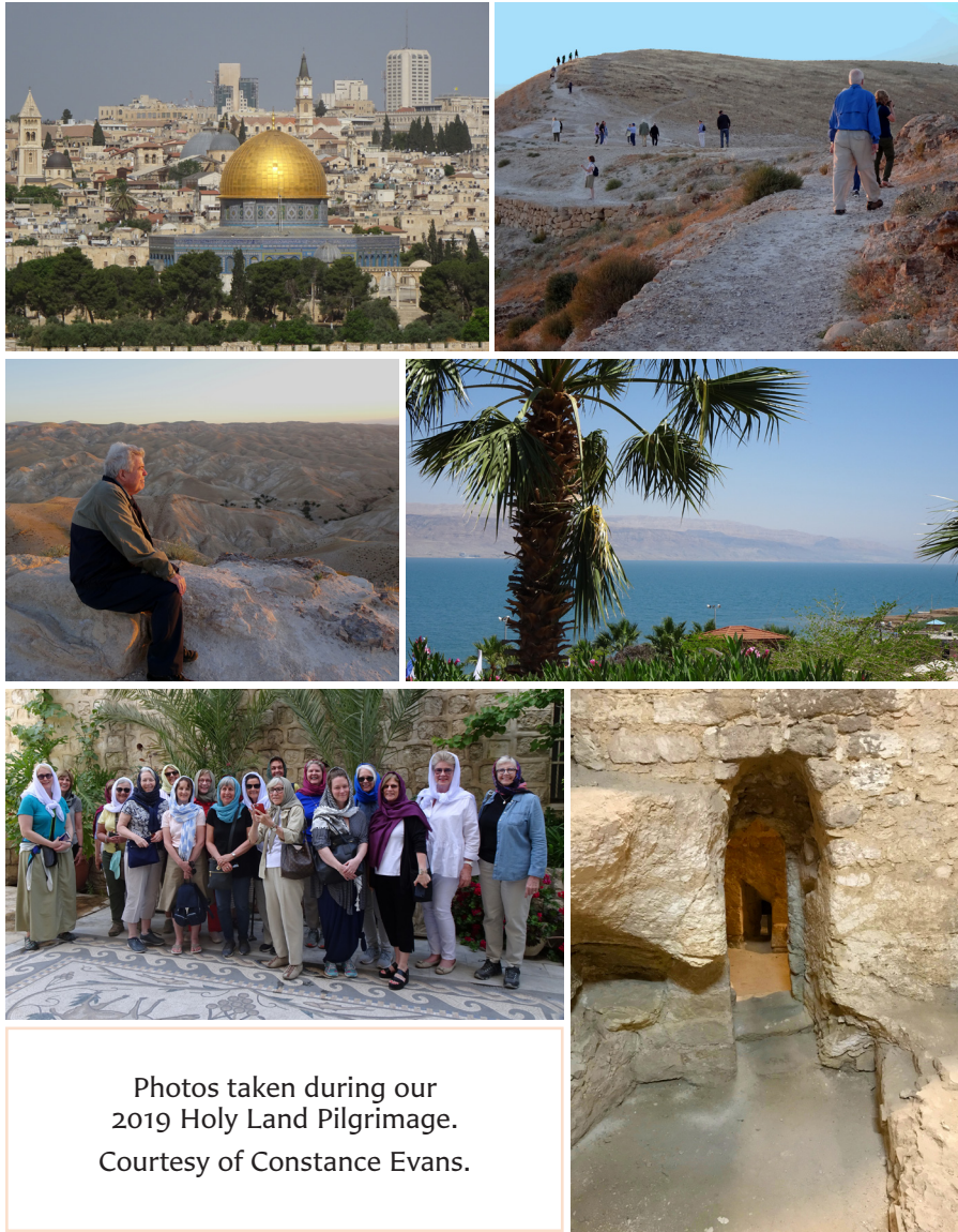
Photos taken during our 2019 Holy Land Pilgrimage.